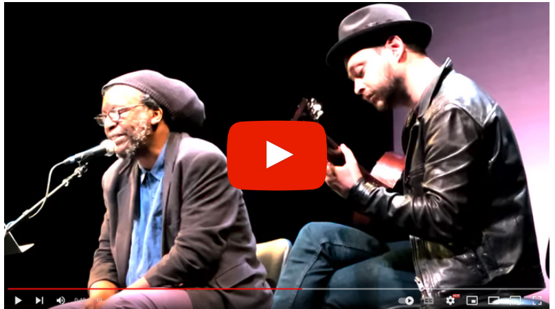
VIDEO BY JOE BRONDO

Guild Hall is the cultural heart of the East End: a museum, performing arts, and education center, founded in 1931.