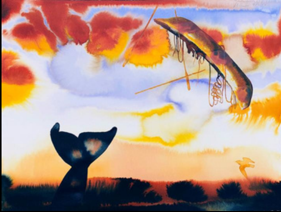
Alexis Rockman Perilous Work , 2020