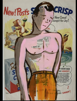
David Salle Untitled , 2018