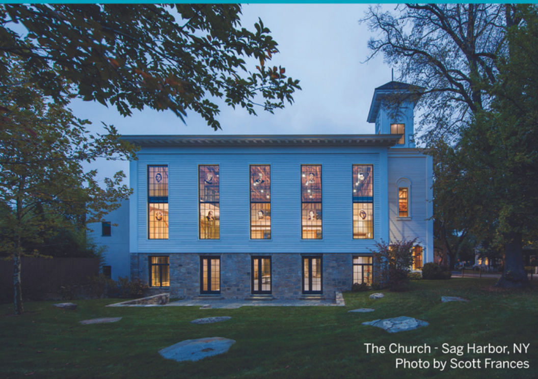
The Church - Sag Harbor, NY

Congratulations to GUILD HALL on being a cultural arts leader on the East End for 90 years!